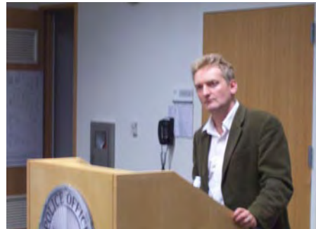
September 2008 - Best-selling author Giles Milton presenting his new book "Paradise Lost-Smyrna 1922". Milton shares his insight and research into the compelling true story of the burning of the port city of Smyrna by Turkish forces.